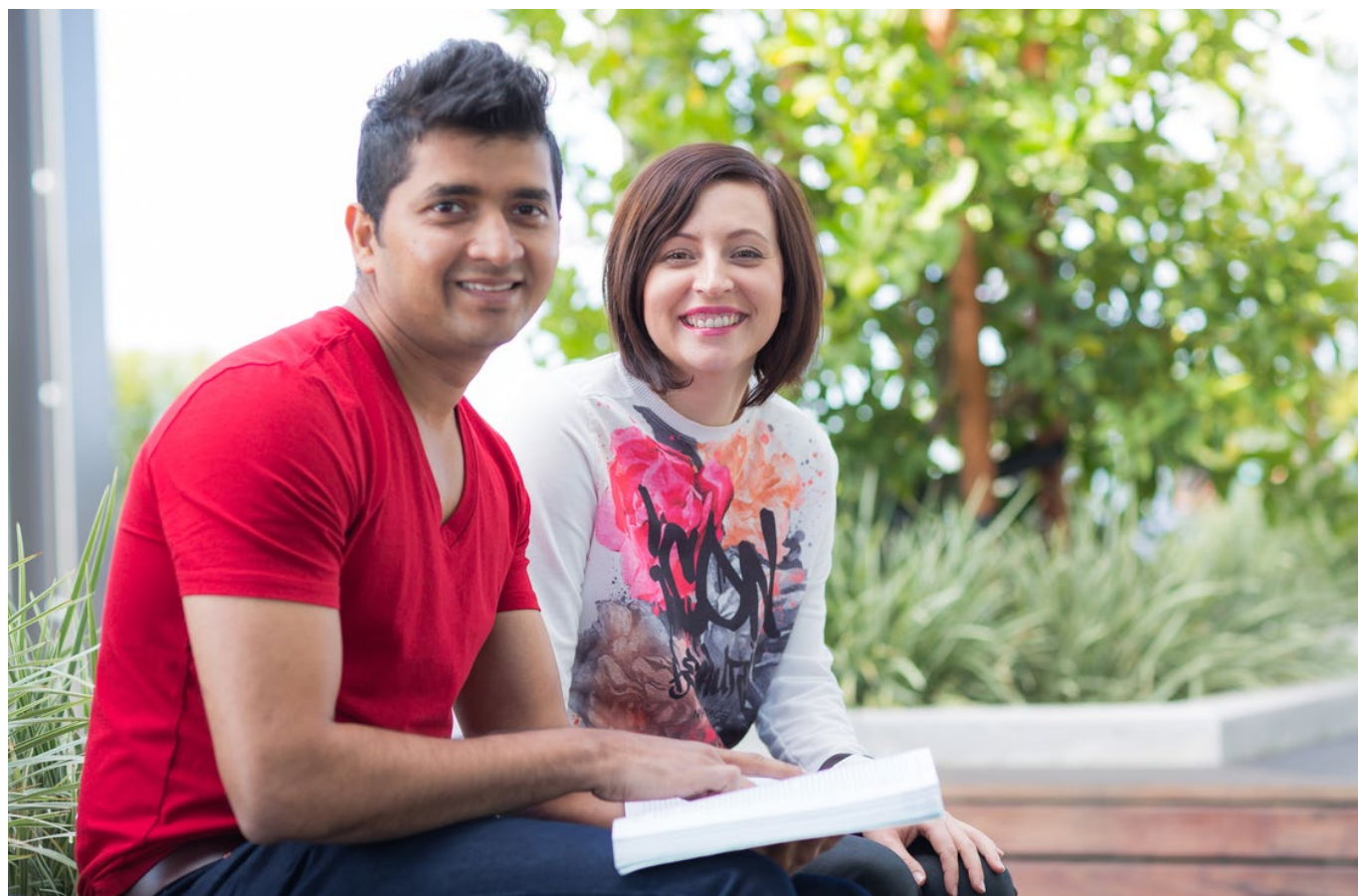
(Above) ACU students, Melbourne Campus