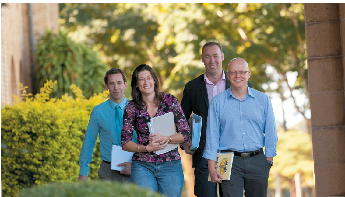
ACU students, Brisbane Campus