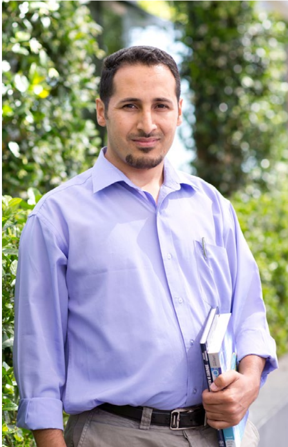
ACU student, North Sydney Campus