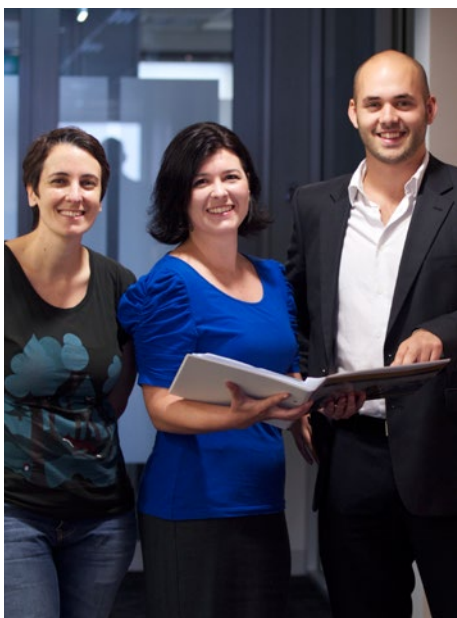
(Top) Students, North Sydney Campus (Bottom) Students, North Sydney Campus