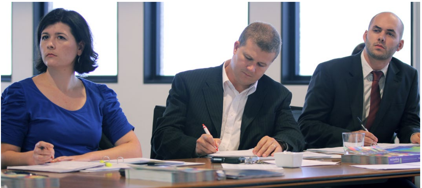
(Top) ACU staff and students, Brisbane Campus, (Bottom) ACU students, North Sydney Campus