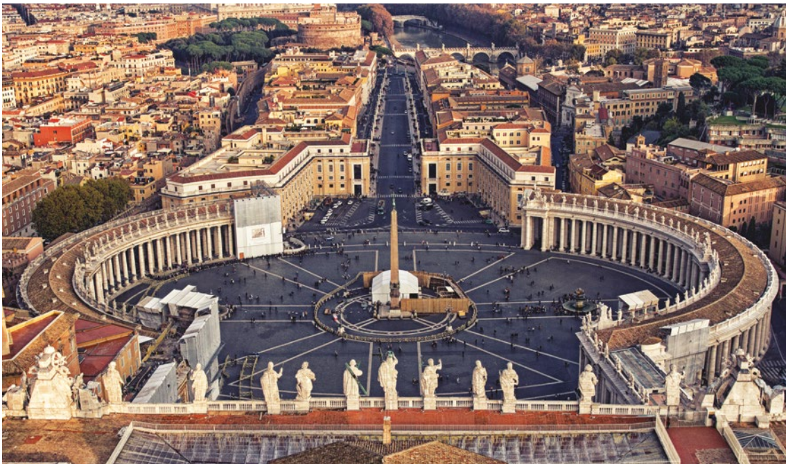
(Top left and right) ACU students, Rome Campus, (Bottom) Vatican City