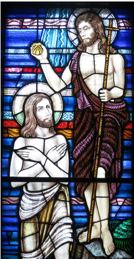
Saint Mary of the Presentation Catholic Church (Indiana)

It is a common misconception that when parents and godparents are asked to renew their baptismal promises in the celebration of baptism of children they do so because the children themselves are too young to make their own baptismal promises.