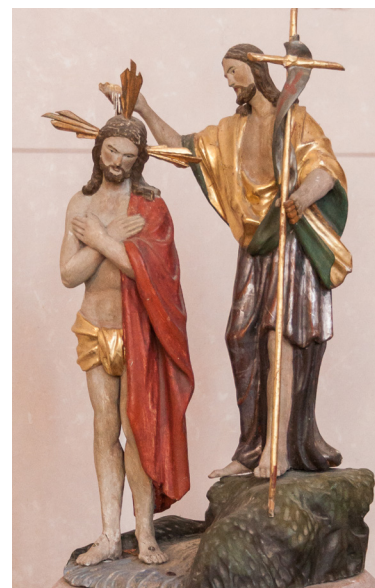
Catholic Parish Church of St. Agatha in Kimratshofen

The Liturgy Nexus and Liturgy Nexus for Schools are online subscription-based closed networks run by the ACU Centre for Liturgy and designed for conversation on liturgical issues, resource sharing and problem solving. The Liturgy Nexus links postgraduate-qualified liturgists, current students of liturgy and those working in a liturgy-related profession, such as liturgical architecture, art or music. Membership is granted to applicants who meet the eligibility criteria. The Liturgy Nexus for Schools links those preparing liturgical celebrations in school communities. To apply for membership or associate membership, depending on your qualification level, visit our website. Membership costs $30 per year (not pro-rata), renewable on or before 1 March each year.